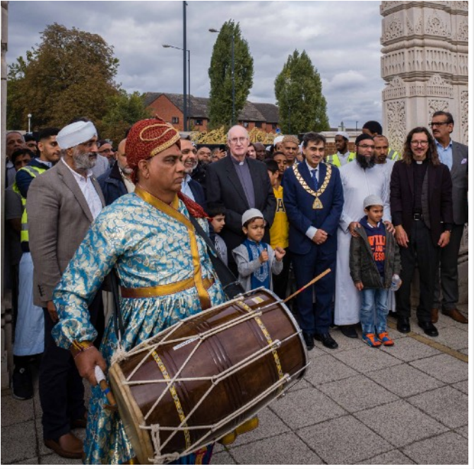
Lunch at the mosque (top left) and entering the temple (top right)