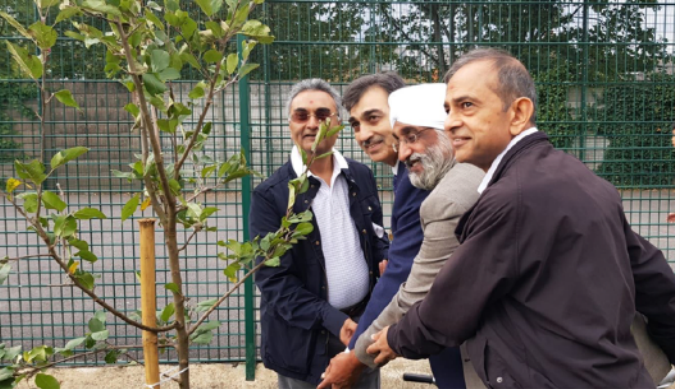
Planting trees at the Harlesden Town Garden together