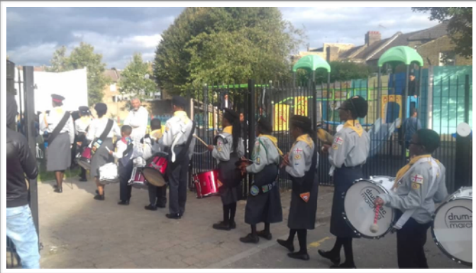
Wilesden Pathfinder Club and Drum Corp, led the procession from the tree planting ceremony to the church.