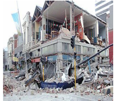
New Zealand Earthquake