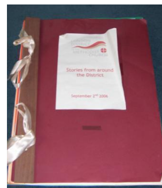
The London District story book

We belong together and since that day countless links have been generated across the district as we have travelled around and told our stories – for good or for ill. We belong together for better or for worse and this global city is impacted by those relationships.