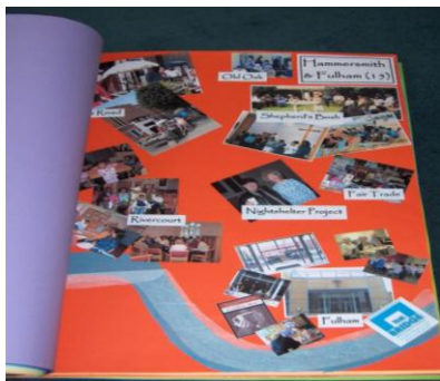
Page from the London District story book

And what about the story book? That visible sign of our commitment to one another, as representatives of each circuit prepared their page of the book and brought them forward to be bound together as we inaugurated this District.