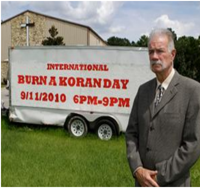
Pastor and church in Florida

A day that continues to evoke strong reaction and highlights the way in which the actions of a thoughtless few can have ripples across the world. Over the last few days all the media focus seems to have been on one small church of 50 members in Florida. One pastor, 50 members, dangerous publicity and the world is on edge. If only it were that easy to get good news into the press! Our words and actions are capable of changing the world.