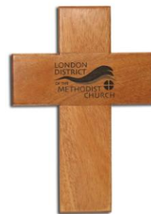
The London District Cross

What about the crosses which were given to representatives of each of the churches in the District and which are still given prominent place in the vast majority of our churches? A sign of our belonging together in Christ.