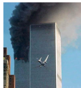
9/11 twin towers

A day that has shaped subsequent history and highlighted the impact our words and actions and relationships have across the world.